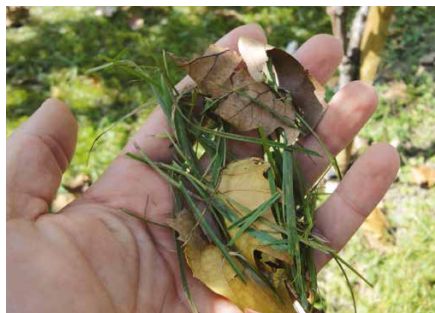
The result: finely chopped mulch