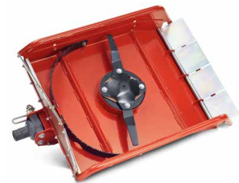
Robust, 8 mm thick steel blades