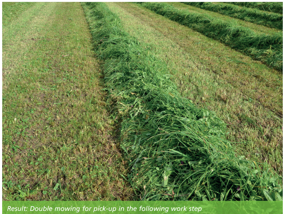
Result: Double mowing for pick-up in the following work step