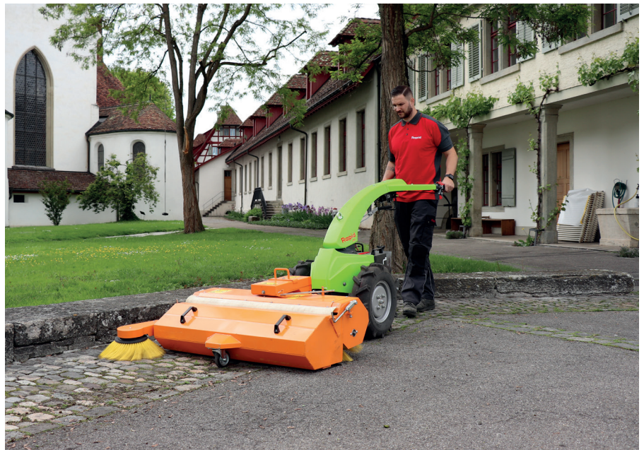
The result: cleanliness for an appealing and inviting atmosphere