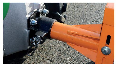
Tool-free quick coupler

Rapid machines are ready for action in next to no time. Various attachments can be fitted and swapped over quickly and conveniently using the tool-free coupling system.