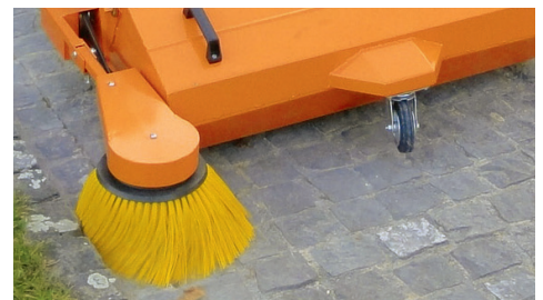
Side brush for complete cleanliness

Top Efficiency The optional side brush allows you to clean every last nook and cranny of paved open areas with absolute perfection. If the operator deviates slightly from the intended route along the edge of curbs and walls, the robust yet flexible side brush compensates for this by offering the necessary flexibility. The result: meticulously clean open spaces.