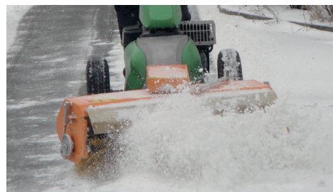
Sweeping with the open system

If the Combi-Sweeper is used without the dirt container, you have an open system which sweeps dust, dirt or snow away to the front of the machine. With the brush laterally positioned, the dirt gets swept to the side. By performing several parallel runs, this means you can even sweep fairly large open spaces without using a dirt container.