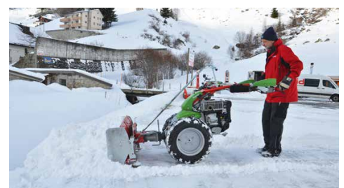
Even more power and comfort when clearing large amounts of snow thanks to side panels.