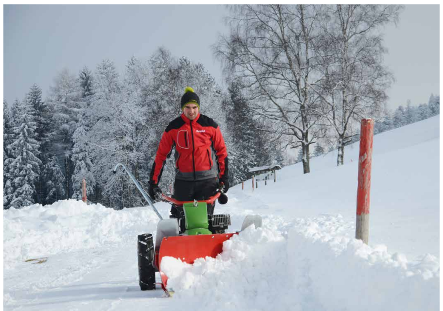
The result: safety achieved through a professional approach to snow clearance