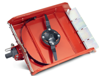
Robust, 8 mm thick steel blades