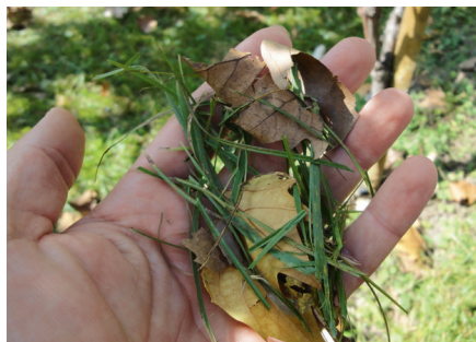
The result: finely chopped mulch