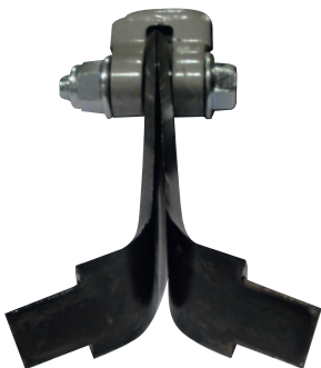
Patented ESM-Y blade pair

What professionals like about Rapid machines is their quality, efficiency, sturdiness and durability. The low maintenance and service costs incurred over many hours of operation mean that Rapid Flail Mowers are also a force to be reckoned with in terms of value for money.