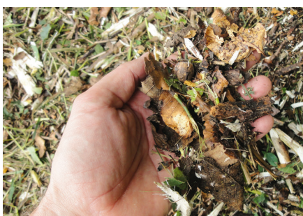
The result: finely chopped cut material