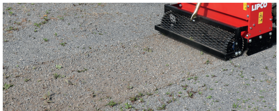
The result: Plants pulled out lie on intact layers.

After the weeds have been removed, the plant material lies loosely on the surface. This can be collected together, picked up and transported away in an additional working procedure.