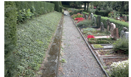
Crushed stone, gravel and grit paths