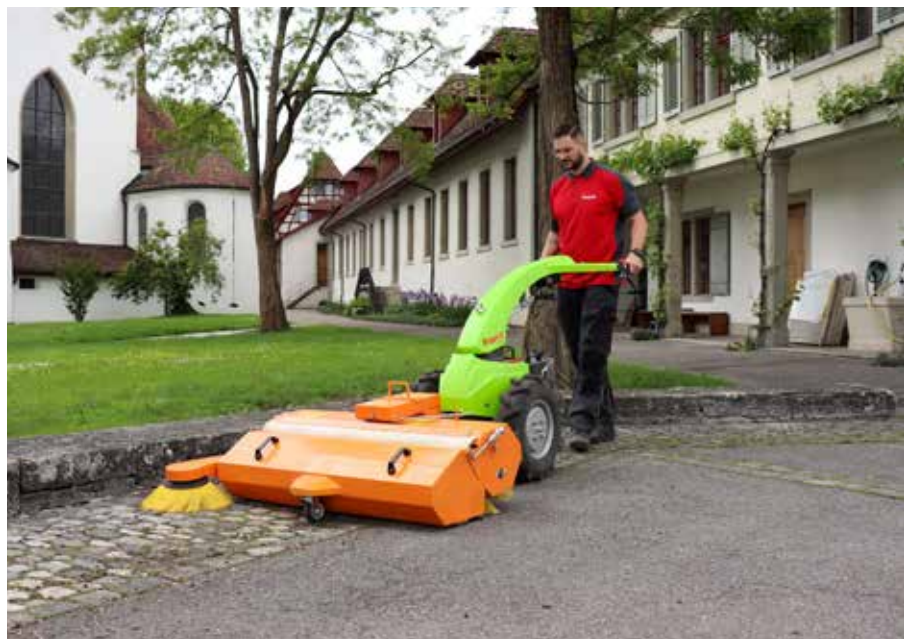
The result: cleanliness for an appealing and inviting atmosphere