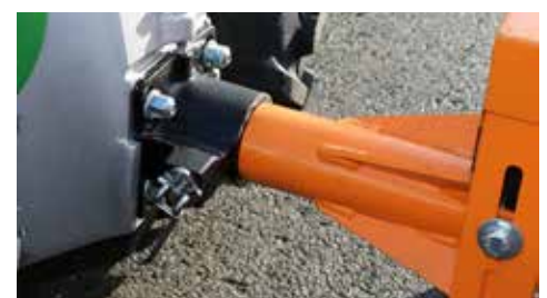
Tool-free quick coupler