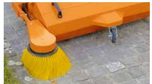
Side brush for complete cleanliness

Top Efficiency The optional side brush allows you to clean every last nook and cranny of paved open areas with absolute perfection. If the operator deviates slightly from the intended route along the edge of curbs and walls, the robust yet flexible side brush compensates for this by offering the necessary flexibility. The result: meticulously clean open spaces.