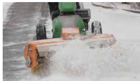
Sweeping with the open system

If the Combi-Sweeper is used without the dirt container, you have an open system which sweeps dust, dirt or snow away to the front of the machine. With the brush laterally positioned, the dirt gets swept to the side. By performing several parallel runs, this means you can even sweep fairly large open spaces without using a dirt container.