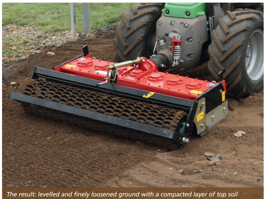
The result: levelled and finely loosened ground with a compacted layer of top soil