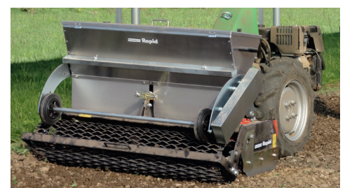
Uni-Rotary Harrow with drilling container